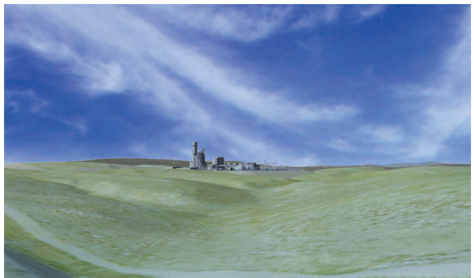
Artist's rendering of Langley Gulch Power Plant, looking south from I-84.